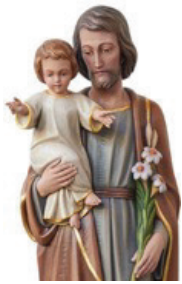
St. Joseph Church